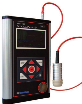
NKD - 019E «UltraSonic»