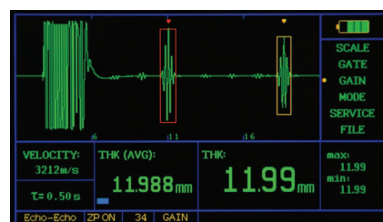
A - Scan