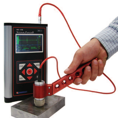
Safety handle for measuring objects with a high surface temperature with UltraSonic